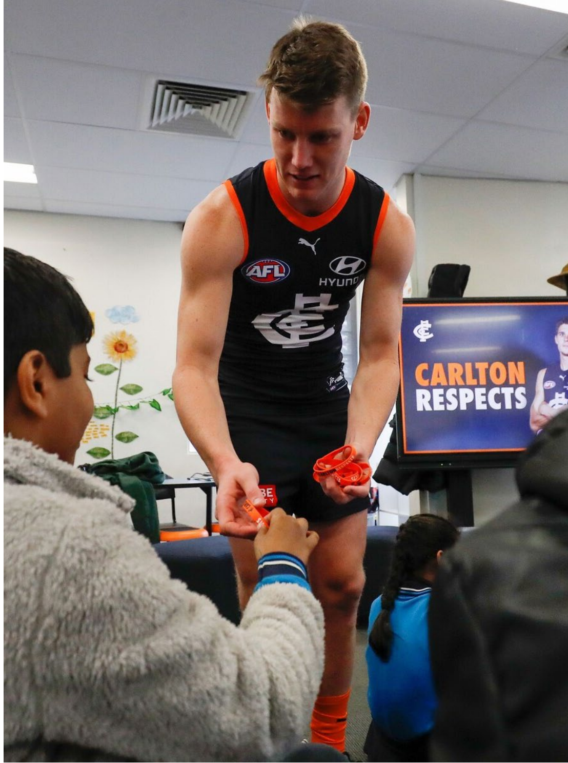
Road to Respect Over 4000 students participated in the Road to Respect schools program in 2024.