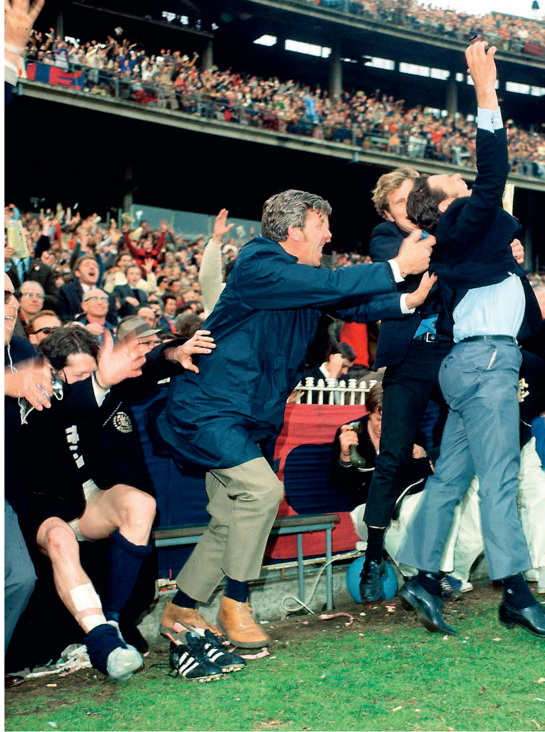
1970 Grand Final Documentary "The Final Story" premiered in 2024.