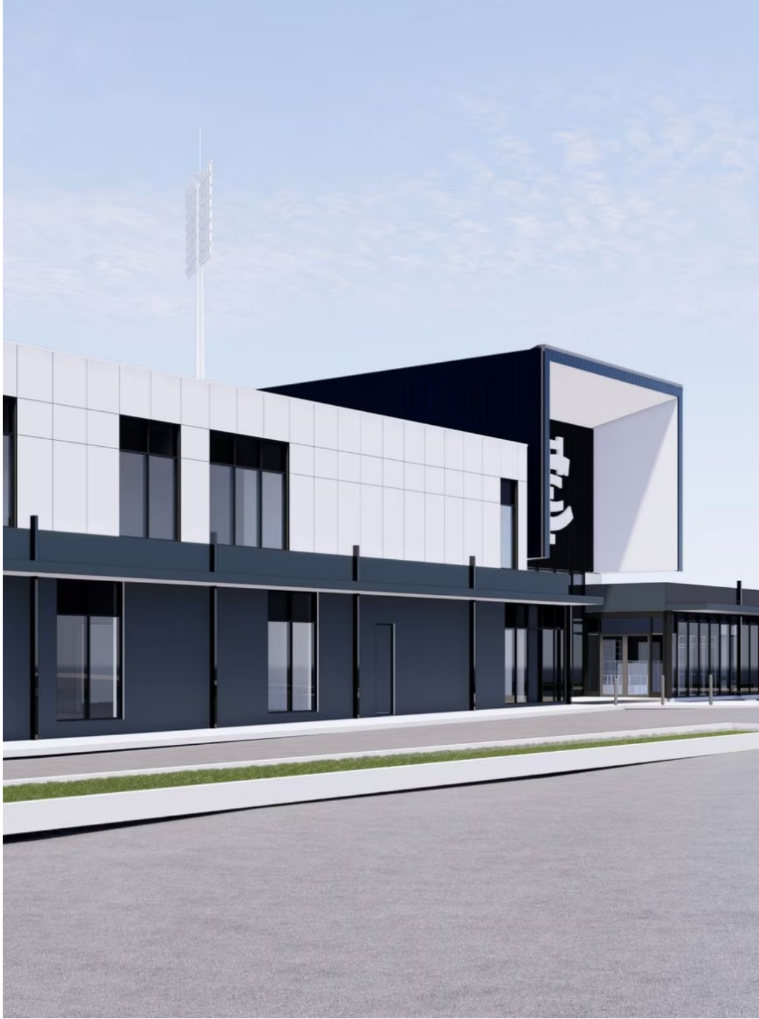
Medical Imaging Centre The build of the state-of-the-art Medical Imaging Centre got underway in 2024.