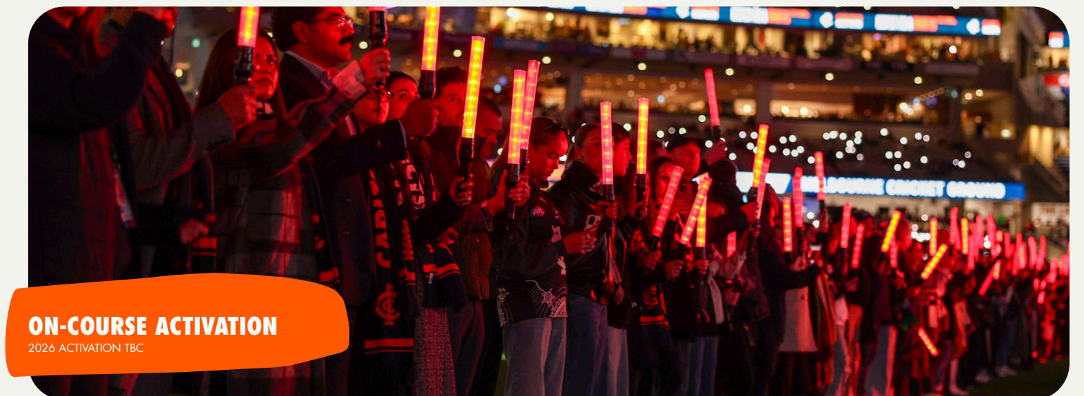
ON-COURSE ACTIVATION 2026 ACTIVATION TBC