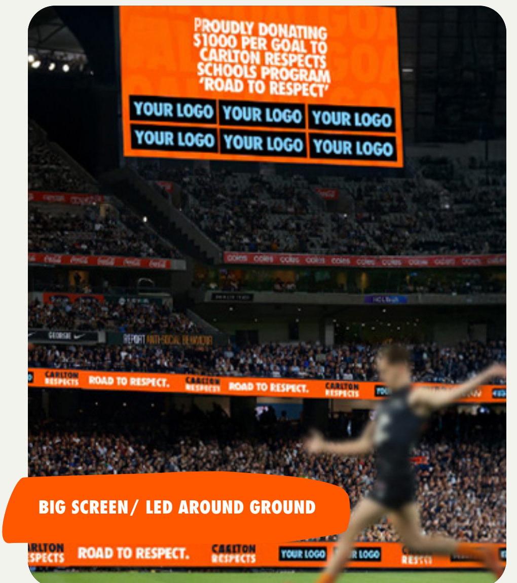
BIG SCREEN / LED AROUND GROUND